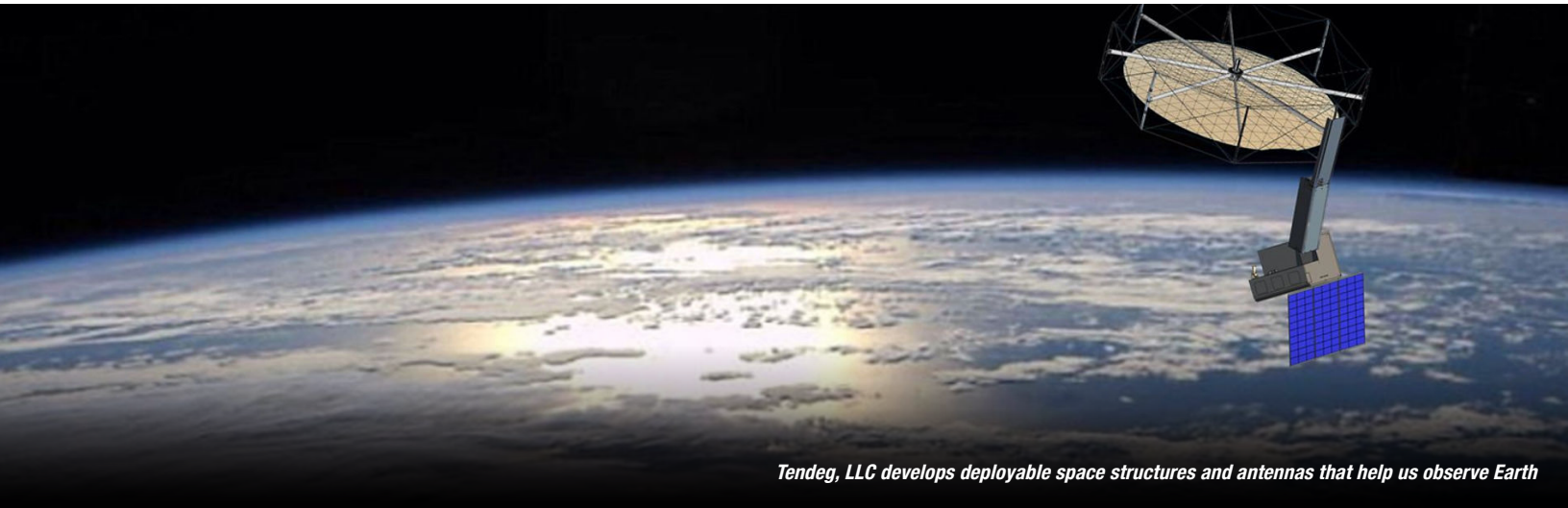
Tendeg, LLC develops deployable space structures and antennas that help us observe Earth