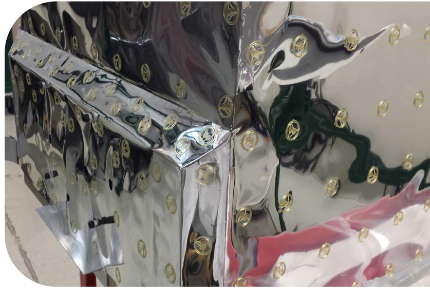
Quest's IMLI uses discrete micro molded polymer spacers to separate layers of insulation

spacers: while traditional MLI uses netting to separate layers of insulation, Quest's IMLI uses discrete micro molded polymer spacers with low thermal conductivity. Quest developed IMLI with support from the NASA Small Business Innovation Research / Small Business Technology Transfer (SBIR/STTR) program. The company received its first NASA SBIR award in 2006 with subcontractor Ball Aerospace—a space and defense business based in Boulder, Colorado—and developed advanced thermal insulation using micro molding technology. As of May 2021, Quest has received 30 SBIR Phase I and II awards to advance MLI technology, collaborating with six NASA centers. After multiple SBIR awards, IMLI was matured through NASA-supported testing from a concept into a usable product, with large-scale testing enabled by NASA's Game Changing Development program in 2013.