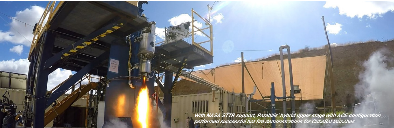
With NASA STTR support, Parabilis' hybrid upper stage with ACE configuration performed successful hot fire demonstrations for CubeSat launches